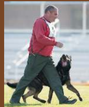
Phalko Aritar Bastet.