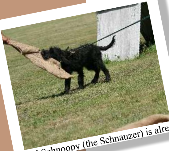
4 month old Schnoopy (the Schnauzer) is already showing great prey drive.